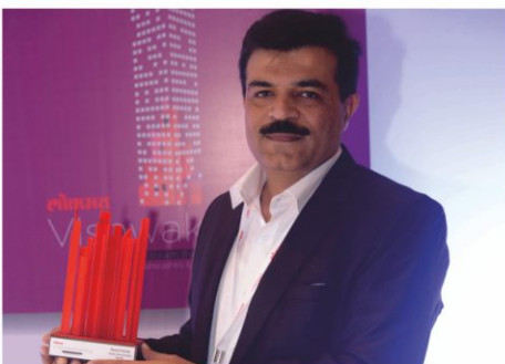
Lokmat Vishwakarma - the dream Builders Maharashtra and Goa