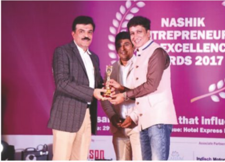
Excellence in Marketing Strategy Maa FM