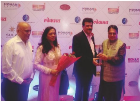
Lokmat Corporate Award For Brand Excellence In Residential Project