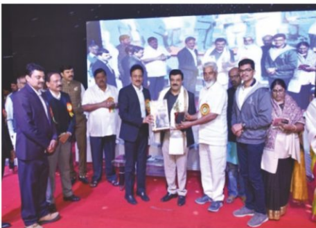
Goda Sanman Puraskar